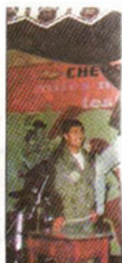
ALL HAIL: Music