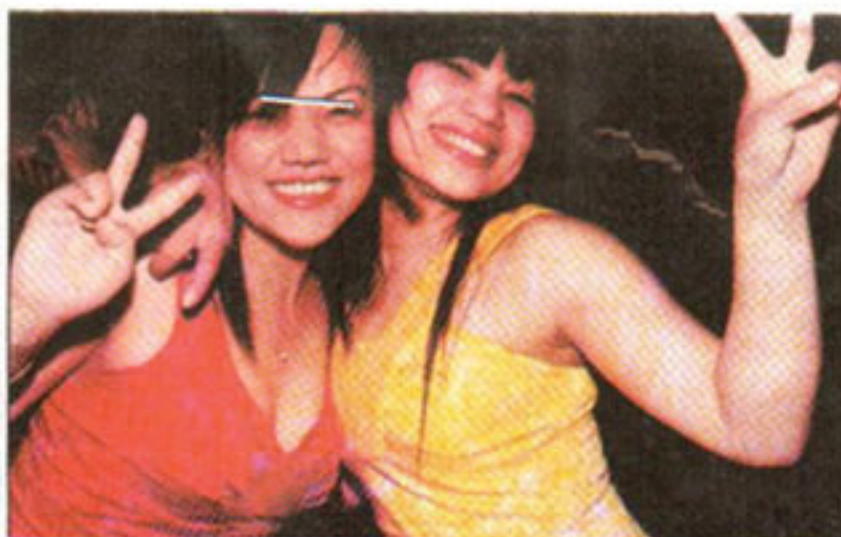
GOD MADE US FUNKY

That's all for this week. Catch ya'll later. Ciao.