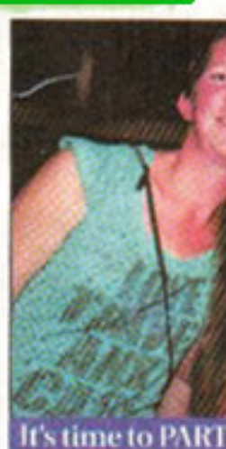
It's time to PARTY

Kathmandu High happenings in K mail photograph bloodym